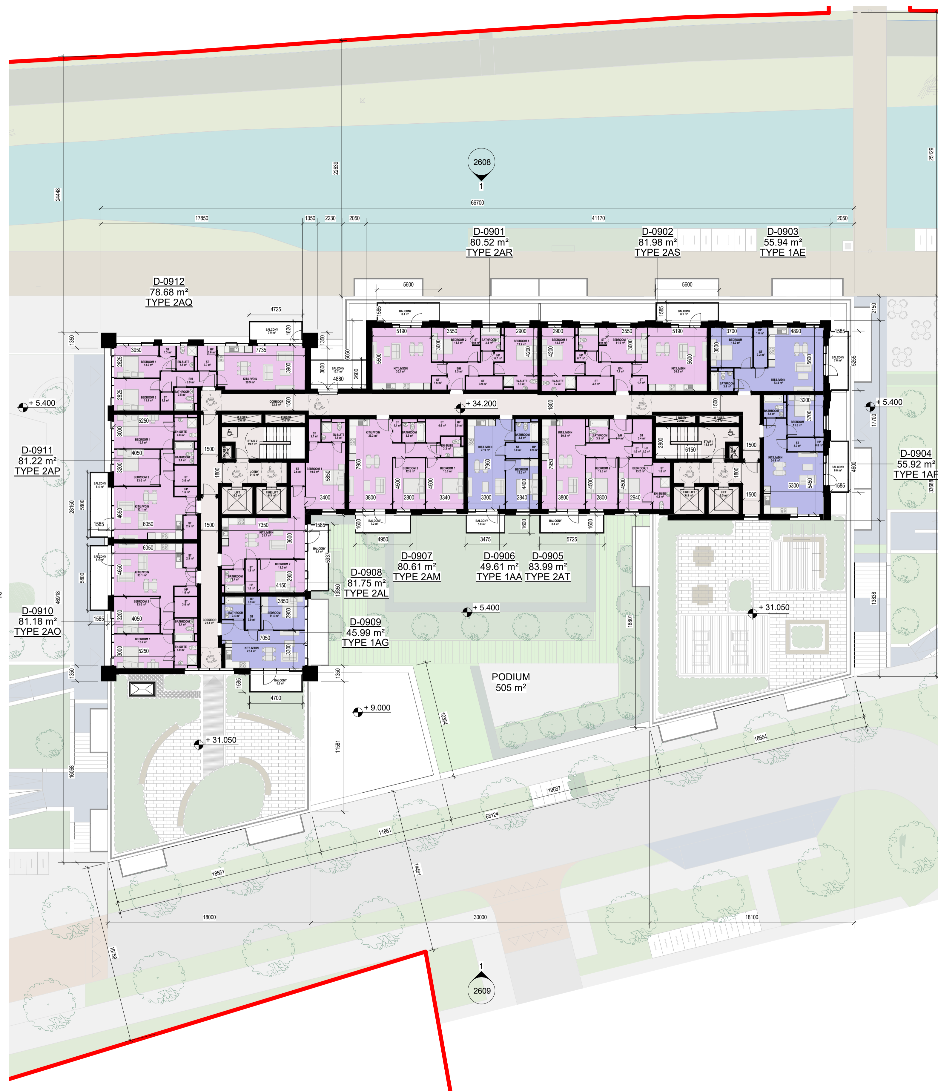
1 PLAN - BLOCK D - LEVEL 09 1:200

Please consider the environment before printing this sheet